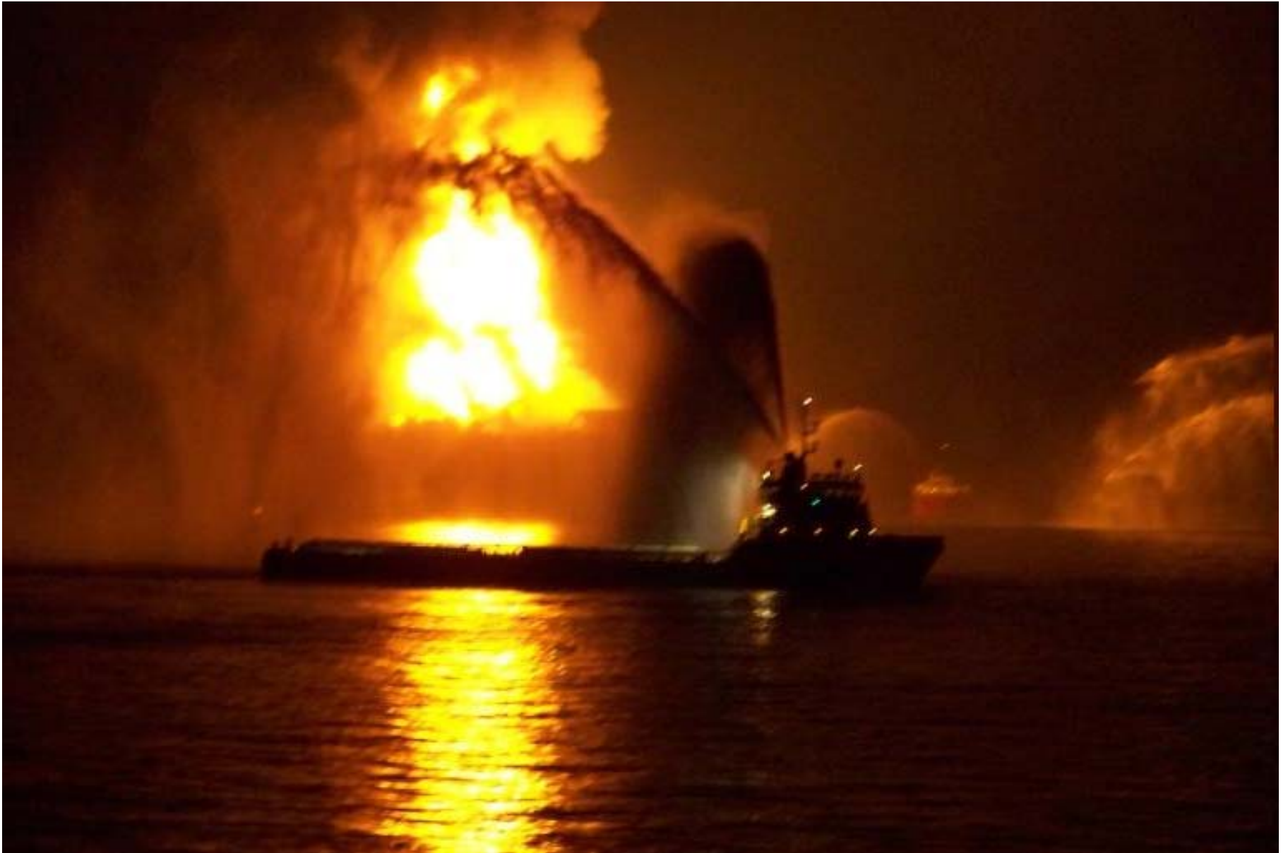
Support vessels using their fire fighting gear to cool the rig